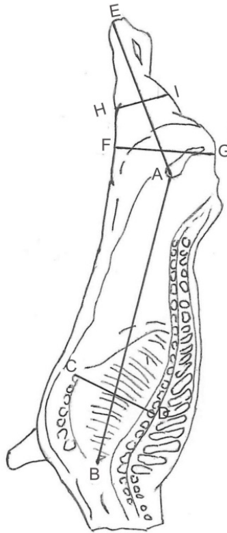
Fig. 1. Linear carcass measurements (Zahariev and Pinkas, 1979)

After deboning the carcass halves, we have found out that the Mutton Charolais crosses produced the higher amount of deboned meat (3.98 kg), followed by the Ile de France crosses (3.84 kg), and the Bulgarian Dairy Synthetic Population (3.21 kg).