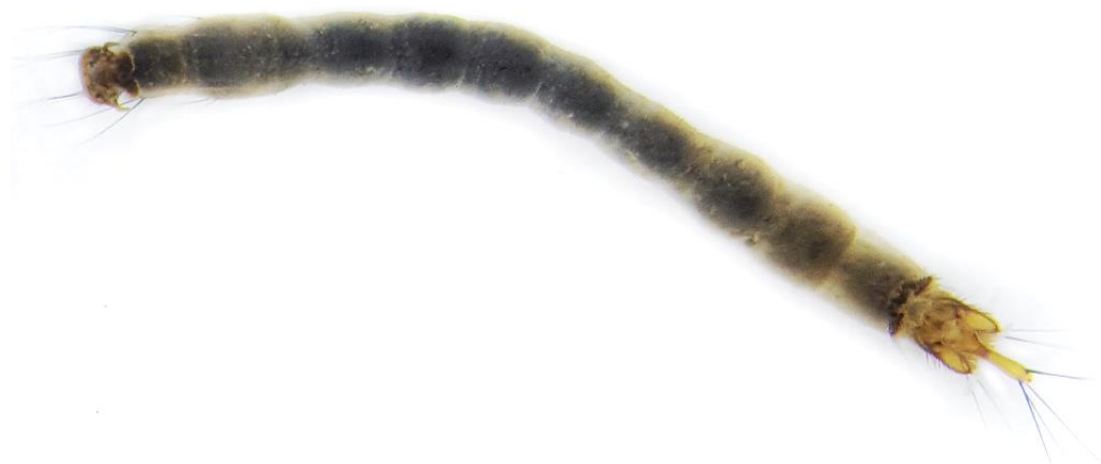
Figure 2. Dixella aestivalis (Meigen, 1818) dorsal view.

The detected D. aestivalis larva is elongated, cylindrical, and somewhat flattened, with 7.8 mm in length (Figure 2). The larva is eucephalic, with a heavily sclerotized head with long antennae approximately equal length as head. The thoracic segment is simple without a leg-like structure. On the dorsal side of the body, there is not a segments of crowns of setae (different from the genus Dixa ). The terminal complex of segments consists of a pair of lateral “paddles” with long chitinous hairs and a single narrowed caudal appendage with six long setae (float structure). The tip of the lateral paddles is clearly shorter than the caudal appendage. The ventral side of the abdominal larval segments bear ambulatory combs divided into two symmetrical halves. A small, sclerotized field named medial scleritis is developed between them, and on the investigated larva it has an isosceles triangle shape. It has taxonomic importance.