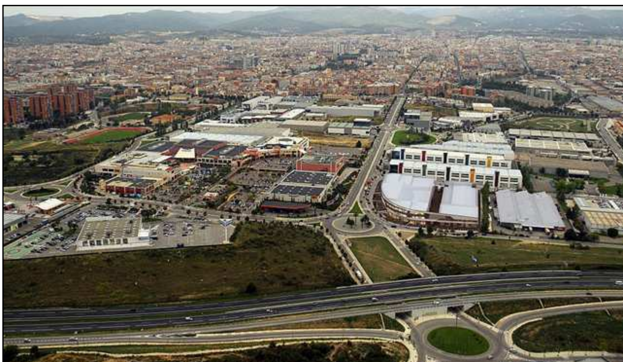
Figure 1: Industrial area Santa Margarida II

vices or finances. In the west, there is a trend of industries going back to towns in a new manner: new types of activities development, new technologies, including digital design, engineering design, testing and manufacturing, backed by internal professional services and innovative technologies. It is referred to a new industry requiring appropriate areas. It is highly important to consider in detail and evaluate which possibilities were open for regional economies by globalization, and whether the concept of noisy and polluting industry isolated from cities has passed away. . Industrial area Santa Margarida II with the area of 55 hectares in the city of Terrasa, Spain. Mixed-use «area» of manufacturing and commercial activities (incl. huge leisure center «Par Buyers») tending to be considered as completely integrated into the city structure. However, it may be perceived being far beyond an ideal one.