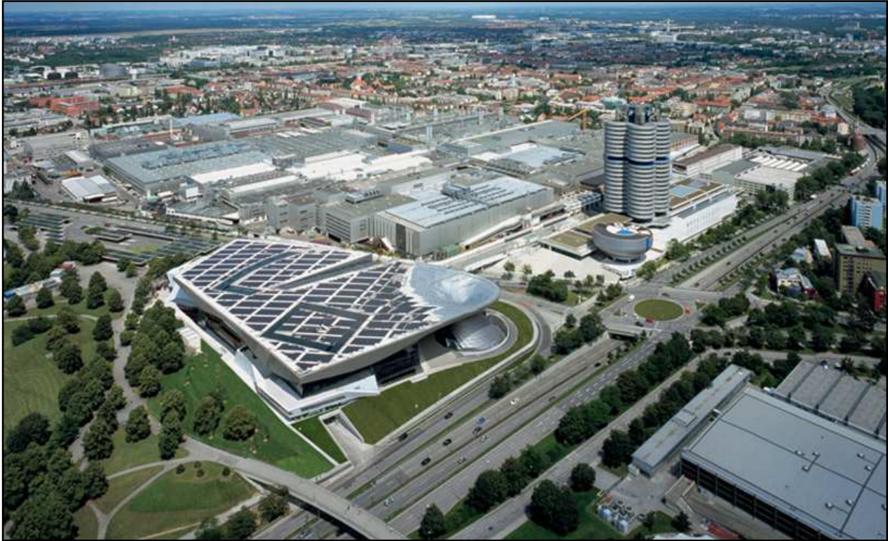
Figure 2: Multi-functional distribution and exhibition center BMW Welt

Munich, Germany. It is located very close to the head-quarters of the company, Olympic park, industrial area and residential districts with underground (subway) lines.