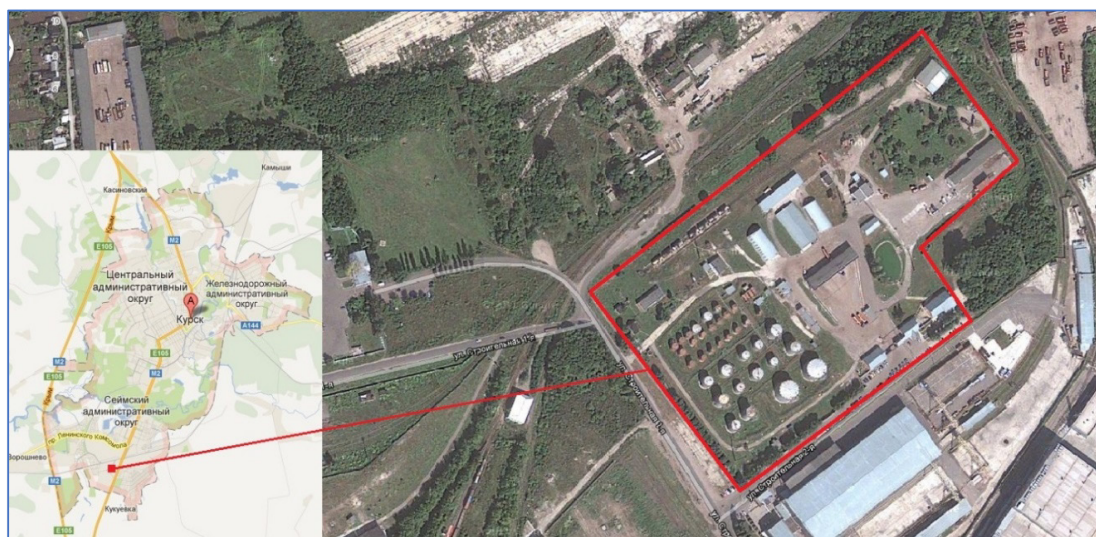
Figure 1: Location of the oil terminal (city Kursk)

The relapse of polluting subsoil assets in the area of Kursk oil terminal (Fig. 1) is no exception. Here, the pollution of hydrolithosphere is manifested in form of a continuous petroleum lens, lying on the groundwater surface, polluting it with dissolved petroleum products [3].