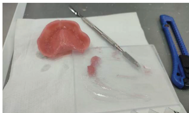
Figure 2. Mixing mass for soft lining and placing it on the base of the prosthesis

At the end of this procedure, the prosthesis was inserted into the patient's mouth. The patient, who retained