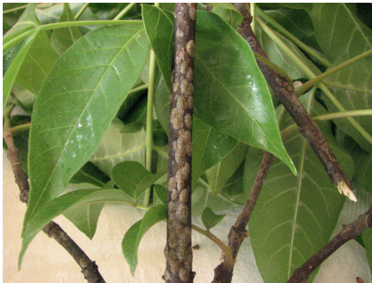
Figure 5. Colony of C. pseudomagnoliarum on C. occidentalis (orig.)