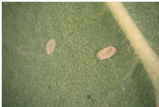
Figure 2. First-instar nymphs of C. pseudomagnoliarum (orig.)