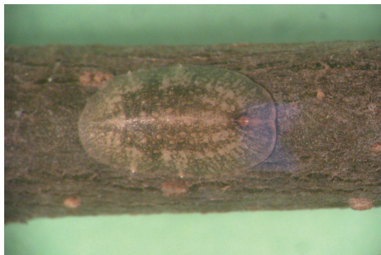
Figure 1. Female of C. pseudomagnoliarum (orig.)

nymphs continue feeding, and after molting they form females (Figure 1). The first appearance of females was recorded at the end of April in 2015 and 2017 and at the beginning of May in 2016 (Table 1). Females feed intensively on plant sap over the following three to four weeks, and then start laying eggs at the end of May. C. pseudomagnoliarum females are ovoviviparous. They lay eggs individually under their body. The duration of embryonic development depends primarily on weather conditions. When the weather is warm, nymphs hatch within an hour, while in cold and rainy weather they hatch after a day. The oviposition period is quite long and lasts from the end of May to the end of June. During that period, eggs laid and already hatched nymphs are located under the female scales. The average number of eggs laid per female is 799.6 \pm 3.3 . The hatched nymphs migrate to leaves to feed there during the summer months, mostly on the reverse side of leaf along its main veins (Figure 2). Due to the extended egg-laying period, first-instar nymphs are present on leaves almost until mid-September, when they molt, forming second-instar nymphs (Figure 3). Second-instar nymphs continue to feed on leaves until October, when they descend to thicker twigs to overwinter (Figure 4).