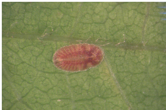
Figure 3. Second-instar nymphs of C. pseudomagnoliarum (orig.)