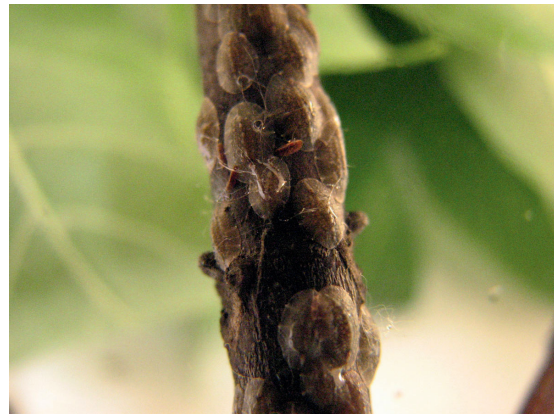
Figure 6. C. occidentalis covered with honeydew (orig.)