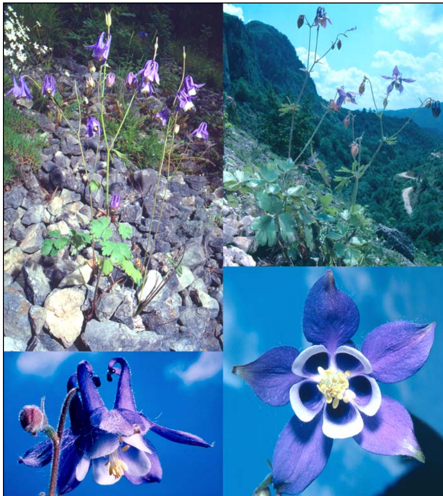
Fig. 2. - Aquilegia nikolicii (Niketić) Niketić & Cikovac from western Serbia: a) A. n. var. nikolicii from the Drina River canyon in vicinity of Bajina Bašta (Peručac village); b-d) A. n. var. pancicii Niketić from the Beli Rzav canyon in vicinity of Mokra Gora (Kršanje village).

Aquilegia nikolicii (Niketić) Niketić & Cikovac, comb. et stat. nov. (Fig. 2) ≡ A. grata Maly ex Zimmeter subsp. nikolicii Niketić in Glasnik Prirod- njačkog muzeja u Beogradu B47: 57 (validated and designated in this paper) – A. grata auct., non Maly ex Zimmeter 1875