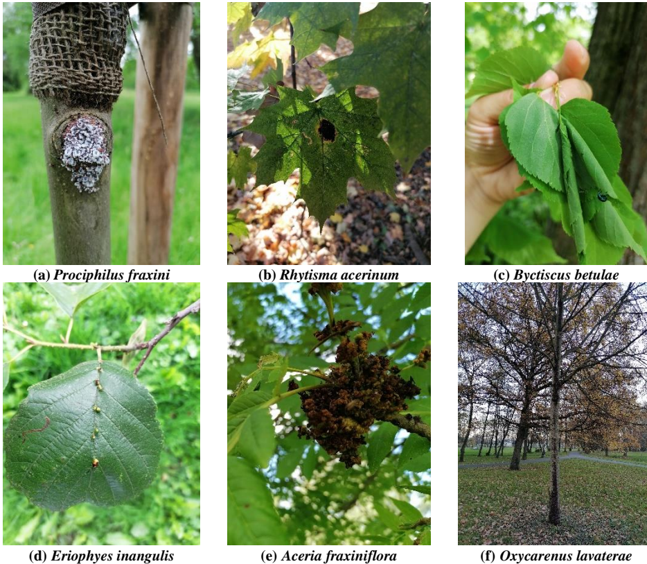
Figure 3. Representatives of the identified pests