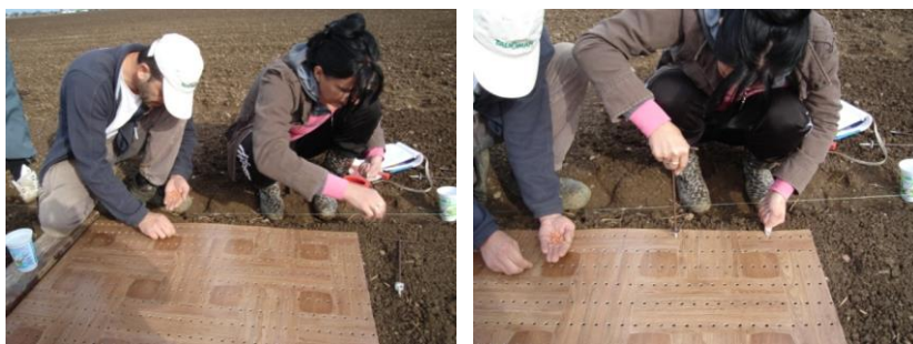
Fig. 1. and Fig. 2. Manually sowing of winter wheat using pattern with a determined sowing density Ручна сјетва озиме пшенице коришћењем шаблона са одређеном густином сјетве

Overwintering plants percentage (%) was calculated as the ratio of the number of overwintering plants and the number of sown seeds (determined sowing density) in each experimental unit.