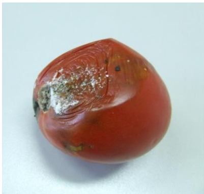
Fig. 3. T. absoluta galleries with secondary pathogens on tomato fruit Ходници T. absoluta и секундарни патогени на плоду парадајза

On stem and fruit, T. absoluta caused galleries which may be filled with black frass. Often fruit galleries became entry ways for secondary pathogens (Fig. 3). However, in our experiment on potato and eggplant as host plant T. absoluta caused damages only on leaves. Since there were no damages on stems or fruit, it implicates those host plants are less attractive for this pest than tomato, which is in accordance with many authors (Deseneux et al., 2010; Salama et al., 2015).