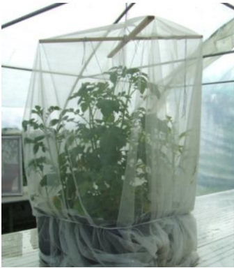
Fig. 1. Insect tent in greenhouse Ентомолошки кавез у пластенику

Larval activity resulted forming irregular mines as big as larval instars usually becoming necrotic (Fig. 2).