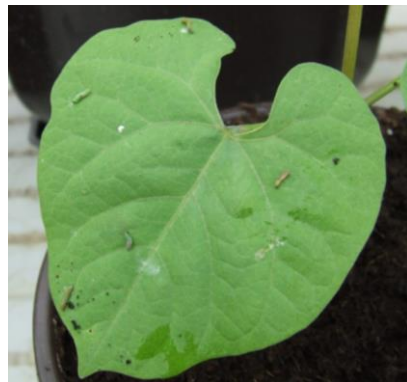
Fig. 4. Dead larvae of T. absoluta on bean Угинуле ларве T. absoluta на пасуљу