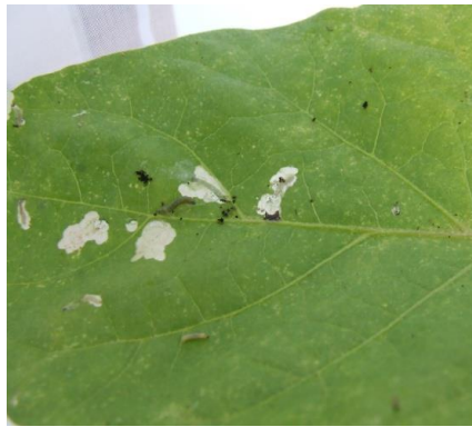
Fig. 2. T. absoluta mines on eggplant Мине T. absoluta на патлиџану

On stem and fruit, T. absoluta caused galleries which may be filled with black frass. Often fruit galleries became entry ways for secondary pathogens (Fig. 3). However, in our experiment on potato and eggplant as host plant T. absoluta caused damages only on leaves. Since there were no damages on stems or fruit, it implicates those host plants are less attractive for this pest than tomato, which is in accordance with many authors (Deseneux et al., 2010; Salama et al., 2015).