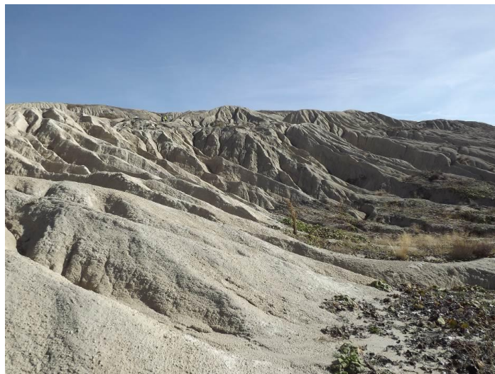
Figure 6 View of the Western External Landfill

The measurements confirmed that the compactness of material, especially in the second and third areas, was poor, which led to the bursting of deposited masses. The auxiliary machines are very little used. Such anomalies must be avoided to the maximum due to the future Great External Landfill.