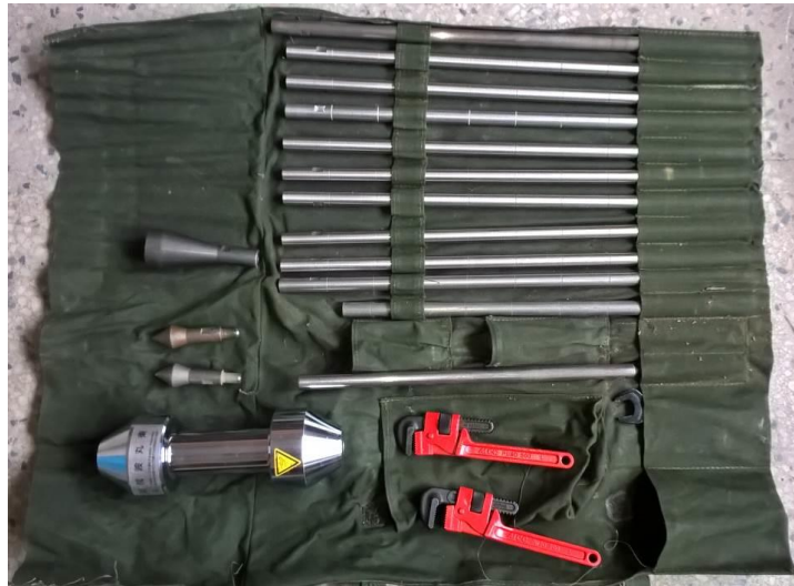
Figure 4 Manual corn penetrometer

Measurements were taken with a manual corn penetrometer on the problematic part of the Western external Landfill (Figure 4).