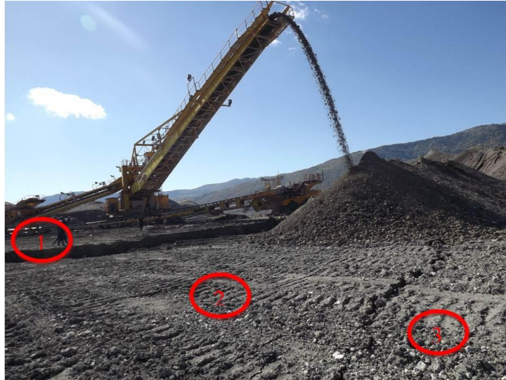
Figure 5 Measuring zones

The following cohesion values were obtained at several measuring points in three measuring zones (Figure 5):