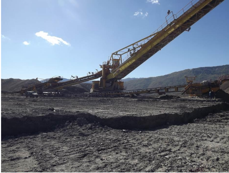
Figure 3 View of the cracks in the landfill

Measurements were taken with a manual corn penetrometer on the problematic part of the Western external Landfill (Figure 4).