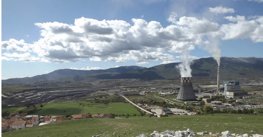
Figure 1 Open Pit Gračanica and Thermo Power Plant