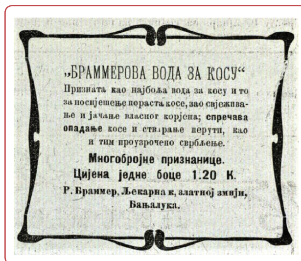
Figure 6: Advertisement for "Brammer hair water", 1906.