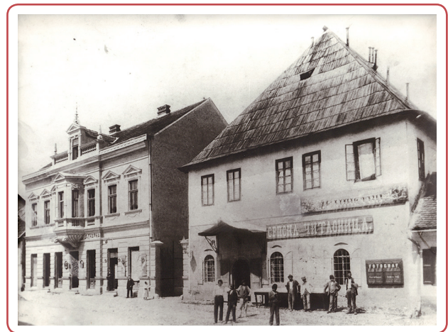
Figure 1: Brammer pharmacy (left), Serbian Reading Room (right), 1898-1899.