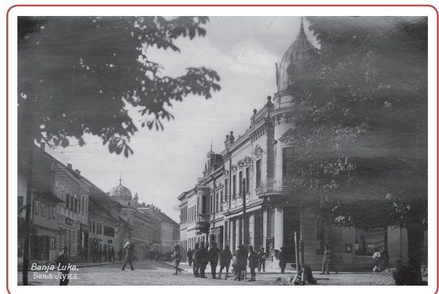
Figure 2: Cafe Balkan on the right corner, next to it Brammer's pharmacy with a protruding bay window, before 1930.

Austro-Hungarian Army on 30 December 1878 and opened the pharmacy on 1 April 1879. The house with the pharmacy was located at the beginning of the Gospodska street, next to the house where the Serbian Reading Room was (Figure 1). At the beginning of the 20th century a restaurant and cafe Balkan was built, 6 and the spatial and decorative solutions of the pharmacy and cafe defined the Gospodska Street (Figure 2). The architectural forms and decorations of the pharmacy building, in terms of its representativeness and general construction concept, later served as a model for future buildings in this street. 9