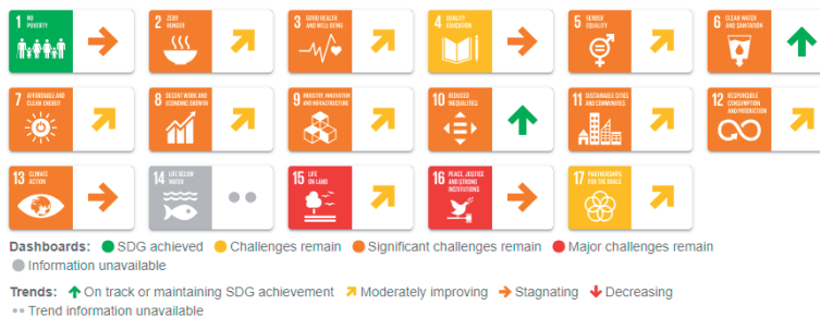
Figure 2. Results of the SDG index for WB (2012-2022)

Table 2 presents SDG Index descriptive statistics for WB. It includes statistical measures for each listed country: Serbia, North Macedonia, Bosnia and Herzegovina, Albania, and Montenegro. By analysing the data presented in the table, collective progress in the overall SDG Indexes of the WB has been noted. However, none of the states managed to position themselves better than the 36th place on the international level in 2023.