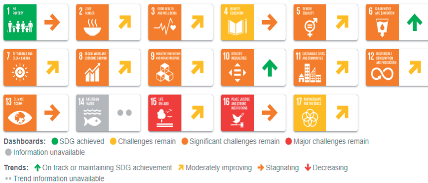
Figure 4. Level of achievement of individual SDGs in Serbia