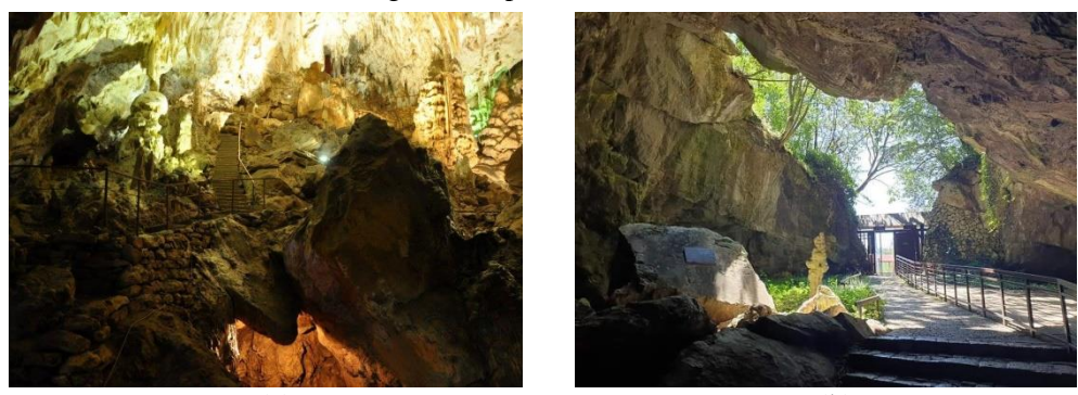
Figure 1: Explored show caves

Some caves have a great religious significance, which is one of the circumstances that should be taken into account during the promotion. For Batu Caves (Kuala Lumpur), promotion through religious rituals and other events that will best present the significance of these caves to potential tourists is suggested (Musa et al., 2017). Also, to increase the number of visitors, it is necessary to use the potential and uniqueness of the Thaipusam celebration through marketing activities (Arasi Paniandi et al., 2018).