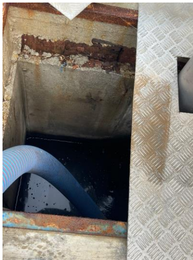
Figure 5 (c): Water Draining from the laundry