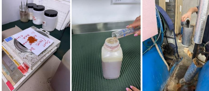
Figure 1: Laboratory of dyeing equipments

The Laundry Department has a production capacity of about 4,000 items per day. The use of ozone-flow technology, which significantly reduces water waste, is another investment of the company. The company produces certified eco-sustainable products for environmental protection.