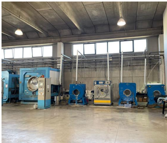
Figure 2: Laundry Machines

The company produces certified eco-sustainable products for environmental protection. In collaboration with many clients, they are developing projects with eco-sustainable products, creating certified washes and fabrics, which are enjoying tremendous success in sales.