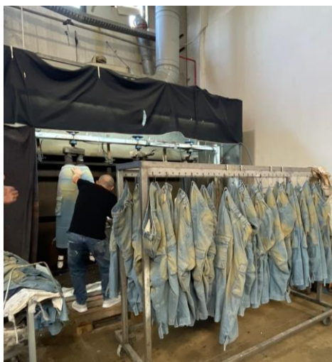
Figure 3 a: Faded Denim product designed in Jeanologia Laser

By using this laser, the company gives the fabric a faded or patterned look based on the client's orders.