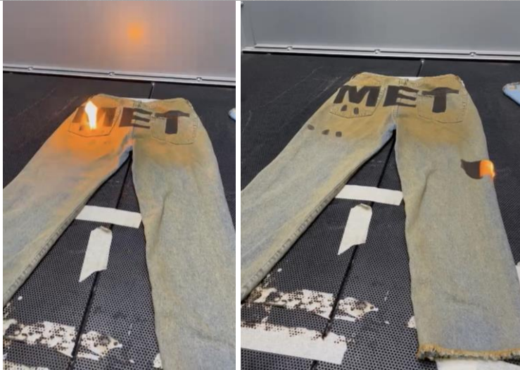
Figure 4: Logo Denim product designed in Jeanologia Laser

This innovative method not only minimizes water usage, replace chemical hazard, reduces time and costs, protect environment based on EU legislation, but also plays a crucial role in protecting workers from harmful processes. That means that the company will have high-quality production and productivity improvement.