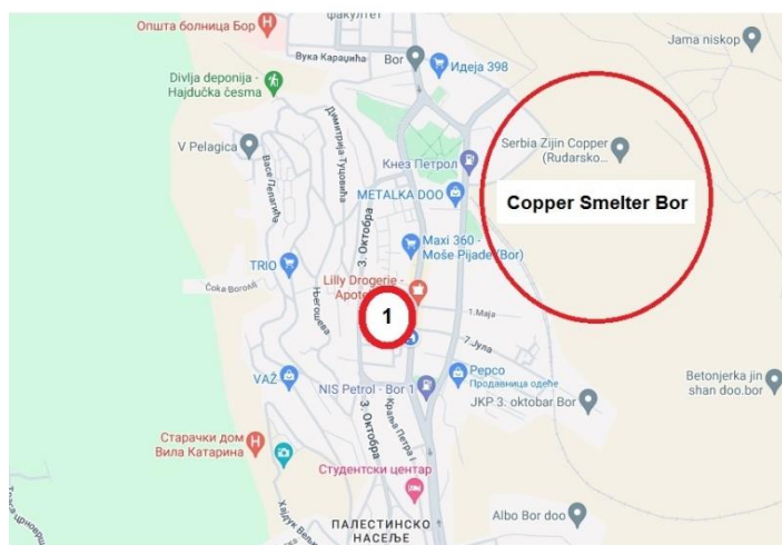
Figure 1. Location of the selected apartment (1) in relation to the Copper Smelter Bor

The impact of human activities on the PM_{10} and PM_{2.5} concentrations was investigated in an apartment in the urban area of Bor. The measurement was carried out throughout the year 2023. The selected apartment is situated about 1 km away from the copper smelter, as shown in Figure 1. The apartment was occupied by 2-3 persons.