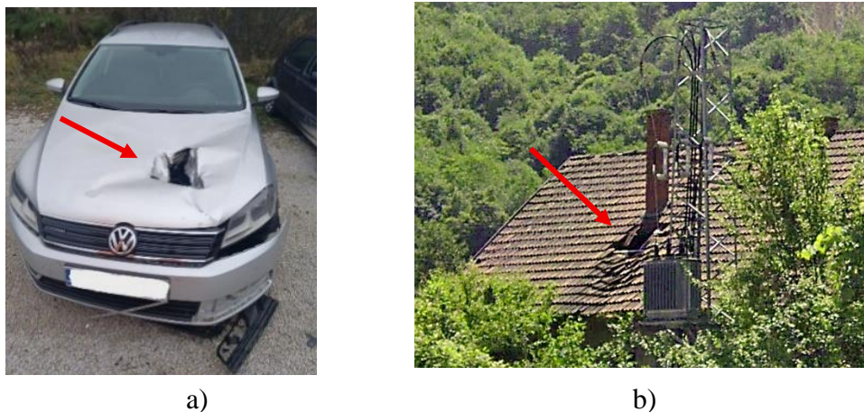
Figure 2. Damage caused by flyrock: a) damaged vehicle in an employee parking lot (525 m), b) damaged roof of residential building 10

As a result of blasting in the southern part of the "O2" quarry, rock material was projected beyond the defined safety zone at over 500 meters. This caused damage to a residential building and a parked vehicle (Figure 2).