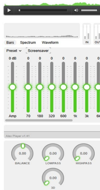
Fig.2. Soundscape Danube recording

The integration of acoustic data provides an additional interpretative layer beyond chemical analysis. For example, NS2 showed both higher chemical stress (TOC, metals) and strong acoustic disturbance, underscoring its role as a critical pressure point. NS1, by contrast, appeared chemically stable but acoustically stressed by traffic. This highlights the importance of combining multiple monitoring approaches to fully understand ecological dynamics. Moreover, the recorded soundscapes from each Novi Sad location are publicly accessible on the official STREAM project platform ( https://stream.democratia-aqua.org ), while a visual representation of the acoustic profiles is presented in Figure 2.