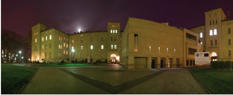
Picture 2. Stanislaw Moniuszko Academy of Music in Gdansk, Yellow Building

Eurhythmics Method was brought to the Academy in 1981. For years the Academy has played an important role in professional teaching of Emil Jaques-Dalcroze's method to its students.