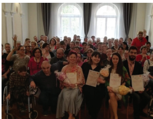
Picture 9. After the concert „Muzyka nie zna granic” with teenagers and adults from the social care community centres in Starogard Gdański and the Serbian and Turkish students

Concerts for children included an educational program: children's songs, artistic music and eurhythmic performances. Folk songs are also performed during these concerts and children have the opportunity to get to know their national identity better, and at the same time, to get acquainted with the music of other cultures and languages performed by Erasmus students. During the concerts participants sang songs, played different instruments and danced. The concerts are interactive, so the host of the concert is in constant dialogue with the children after each performance, asking them questions, encouraging them to make comments and to think critically about music and art. Participating together with the professors in the organization of these concerts, students have the opportunity to gain knowledge about how to organize a children's concert in the most effective way in terms of suitability and quality, which is important for all future music pedagogues and all pedagogues in general.