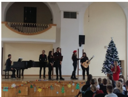
Picture 5. Winter concert for children and Erasmus+ program students