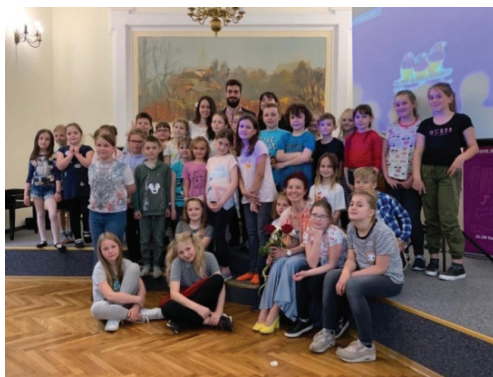
Picture 8. After the concert „Muzyka nie zna granic” with the pupils of Witold Lutosławski State Music School and the Serbian and Turkish students