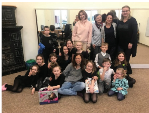
Picture 3. Practical lesson with the pupils of Witold Lutosławski State Music School and the Serbian student

Teacher-training classes took place in the State Music School under the name of Witold Lutoslawski in Starogard Gdański (Państwowa Szkoła Muzyczna I stopnia imienia Witolda Lutosławskiego w Starogardzie Gdańskim) where the students took their teacher-training in the subjects of Eurhythmics and Solfeggio – six 45-minute lessons per month (picture 3). During the internship period, the student learned the theoretical aspect of the method. Initially, she observed the teacher, then she taught two subjects herself (supervised by the teacher).