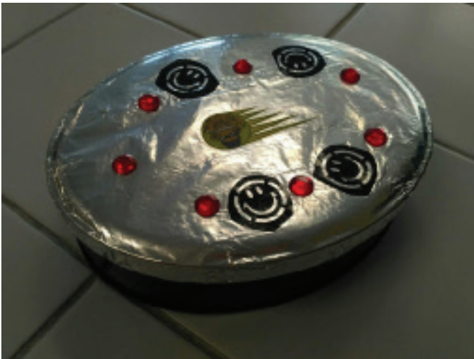
Image 4. Self-made instrument.